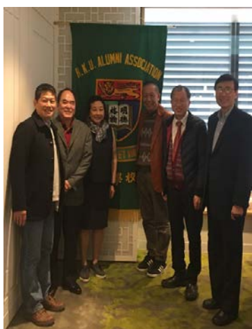
Zilver Restaurant, September 2019