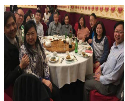
Some of the happy members and guests