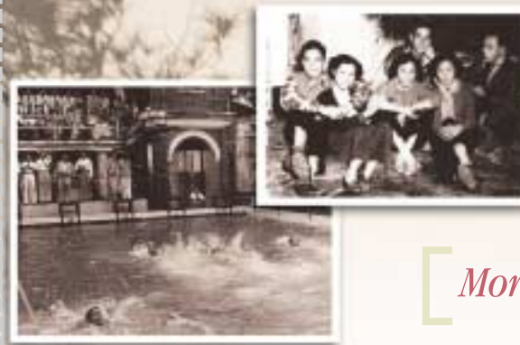
Morrison Hall Pledge Card