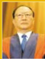
Professor Xu Kuangdi 徐匡迪教授

received the degree of Doctor of Laws honoris causa in recognition of his