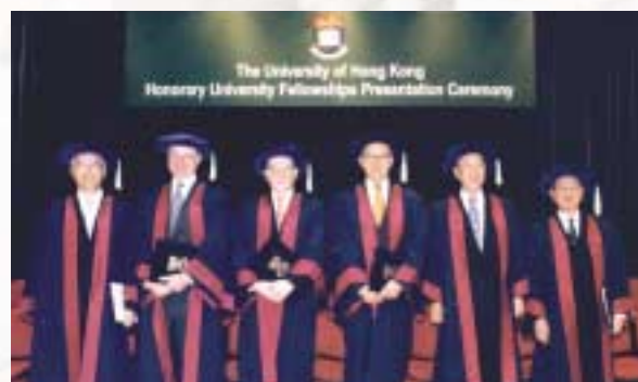
The Honorary University Fellowships were created in 1995 as a mark of the distinction and esteem in which the recipients are held by the University and to better relationships with the community at large.

Dr Lui Che-woo 呂志和, a renowned entrepreneur in Hong Kong, is the Chairman of the K Wah Group. Dr Lui has been active in charitable activities and community service. He is a Founding Honorary President of the HKU Foundation for Educational Development and Research.