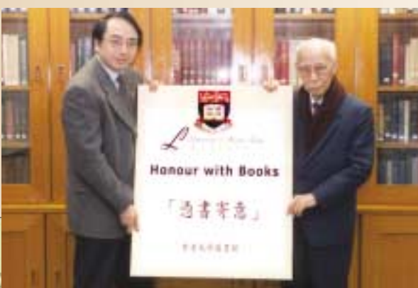
The Vice-Chancellor and Professor Jao Tsung-i jointly launched the HKU Libraries "Honour with Books" programme.