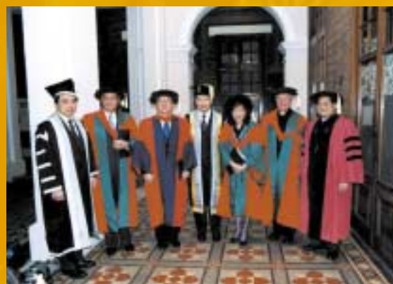
The University conferred honorary degrees on five distinguished individuals on March 20, 2003.

contributions to HKU, his alma mater, particularly through his work as an architect.