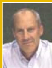
Lord Foster of Thames Bank 諾曼·霍仕達勳爵

received the degree of Doctor of Letters honoris causa for his invaluable