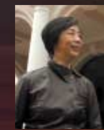
Dr the Hon Sarah Liao, Secretary for Environment, Transport and Works of HKSAR, Mentor since 1998

and my Mentee. I told him that my Mentee would actually listen to what I say."